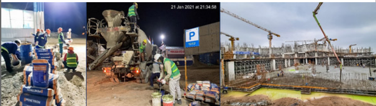
Addition of PENETRON ADMIX and concrete pour at Dragon Hill

7,370m 3 of concrete were treated with PENETRON ADMIX to waterproof the basement structure, foundation slab, basement walls, and water tanks of the hotel and resort. The waterproofing work was carried out by TICO VINA, a Penetron Vietnam approved applicator.