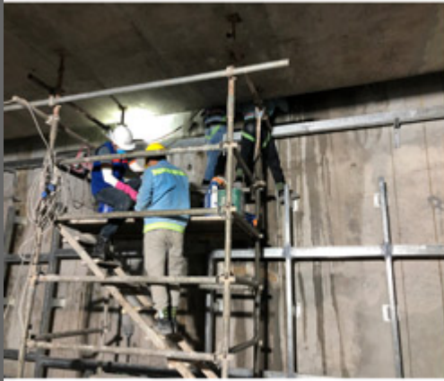
Trial application area