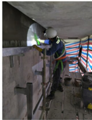
Repair works along the perimeter of the station