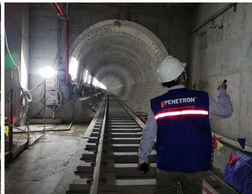
Aerial view of Bason Station and underground tunnel and platform inspection by Penetron Vietnam

Seeking a remedy to this situation, the client contacted Penetron Vietnam for an effective and economic solution. After an assessment of the site and identification of the main problem areas, Penetron Vietnam provided the client with a comprehensive repair proposal utilizing the Penetron repair system. A trial application in one of the most affected areas of Bason Station further confirmed the reliability and performance of the proposed repair solution to the full satisfaction of the customer and subsequently all repair works were awarded to Penetron Vietnam